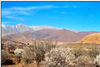
Morocco's Atlas Mountains

Al Akhawayn University is located in the Atlas Mountains, 60 kilometers from the historical cities of Fez and Meknes. At Al Akhawayn, 15-20% of its student and faculty population is international. The University, like Washington College, emphasizes extensive faculty-student interaction, and small classes.