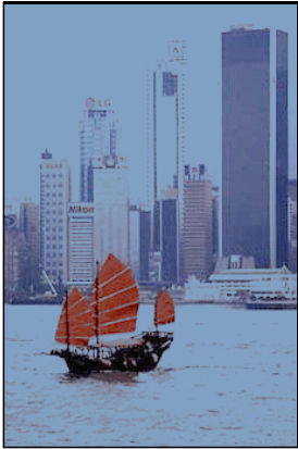
Old and new China meet in Hong Kong