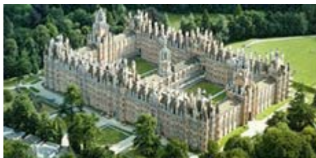
Royal Holloway, one of the colleges of the University of London, houses the School of Management

5,500 students | Fall and spring semesters