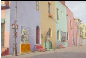
Buenos Aires' La Boca neighborhood

2,200 students | Semesters: Fall (Sept-Dec) and Spring (Jan-May)