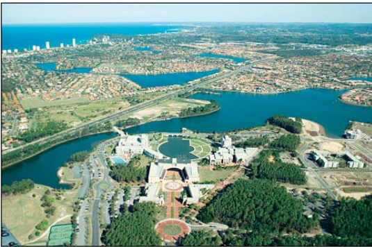
Bond's campus lies close to Australia's Gold Coast beaches