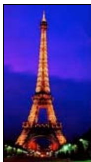
The Eiffel Tower

3,000 students | Fall and Spring semesters