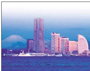
Yokohama, with Mount Fuji

Japan is the world's second-largest economy, home to world-class firms like Toyota, Sony, Canon, and Kyocera. Meiji Gakuin University offers students the opportunity to live in and learn about Japan and Japanese business and management. The university is located in Yokohama, a suburb of Tokyo, Japan's capital.